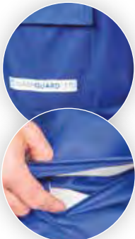
Practical Chest Pocket